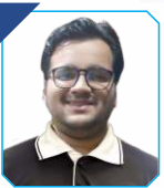
Nayan Anand Brilliant Academy, Indore