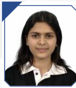
Jagriti Raj Jawahar Vidya Mandir, Ranchi