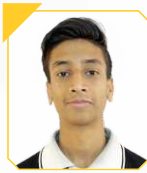
Navneet Dayama Progressive Academy, Pellaad